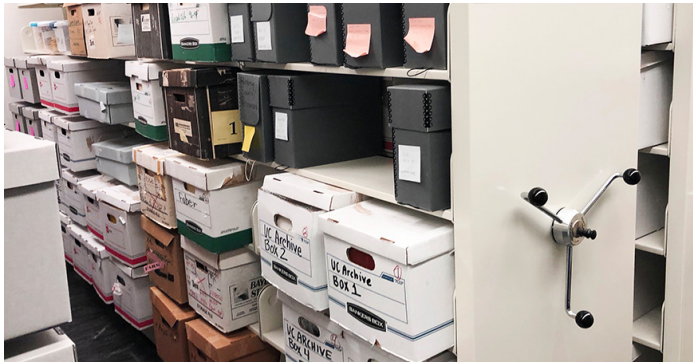
More than 100,000 items will be housed in the one-of-a-kind facility.