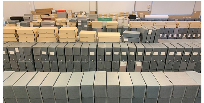
The expanded space will enable the library to preserve and provide access to special research collections.

The National Endowment for the Humanities (NEH) has awarded a $750,000 grant to the UC Merced Library in partnership with the Center for the Humanities to establish a research archive documenting the Sierra Nevada and Central Valley. With an additional $750,000 from the $20 million gift provided by philanthropist and author MacKenzie Scott and her husband, Dan Jewett, to the university last year, the $1.5 million combined will fund a capital project to renovate space in the library to store and showcase a variety of special collections.